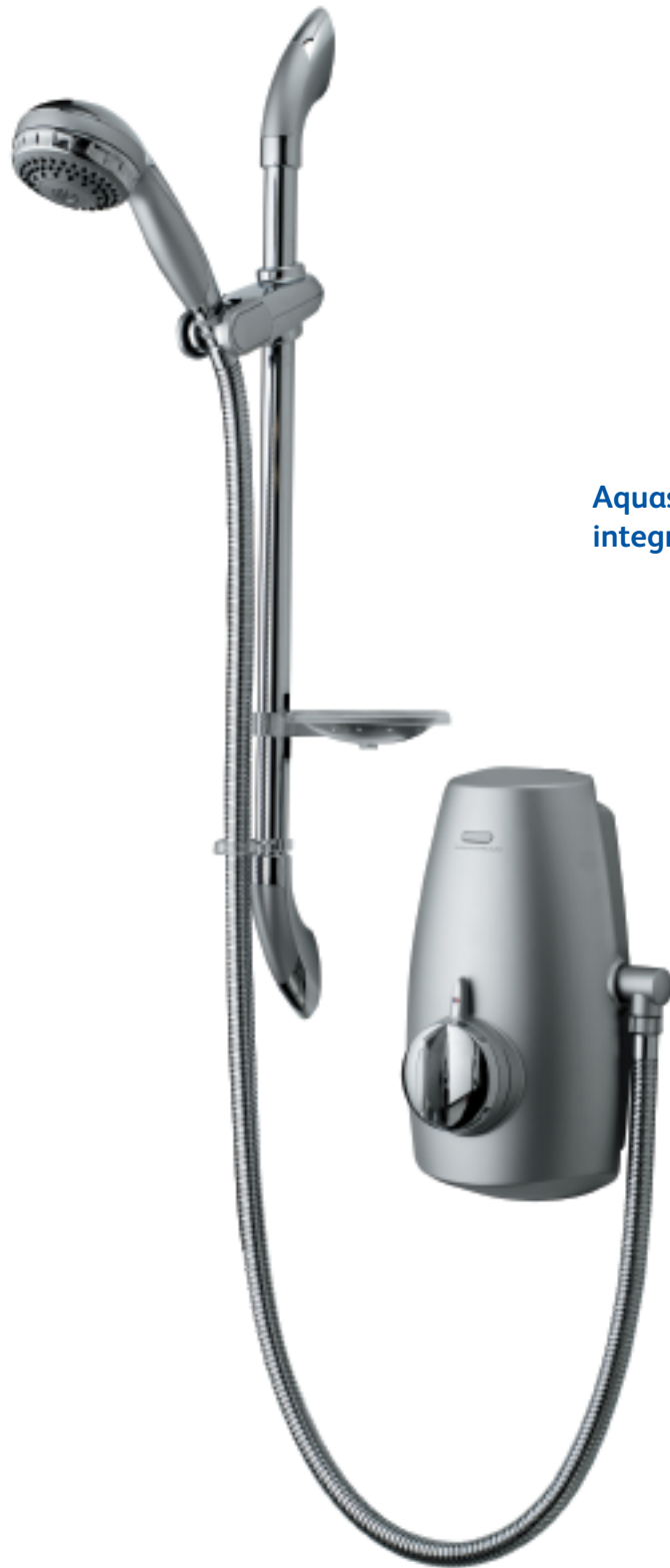
Aquastream Thermostatic integral power shower